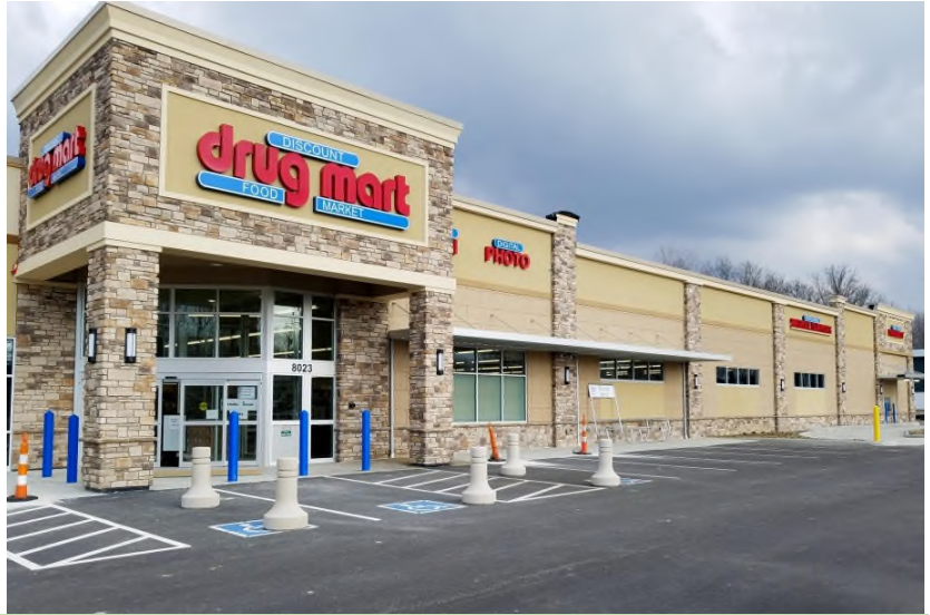
Discount Drug Mart store No. 73 located in North Canton, OH. ca: 2019

The Discount Drug Mart (DDM) headquartered in Medina, Ohio, celebrated its fiftieth anniversary in 2019. Ranked in the top ten of U.S. drug store companies, it was founded in 1969 by an Iranian immigrant, Parviz Boodjeh.