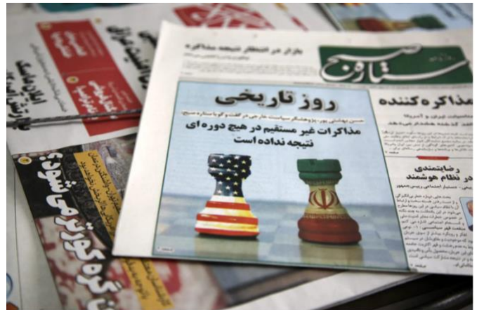
A newspaper featuring the headline story on indirect negotiations between Iran and the United States in Muscat, Oman, is displayed at a newsstand in Tehran, Iran, on April 12. The front pages of major dailies in Tehran prominently featured headlines about the negotiations, highlighting the renewed diplomatic channel amid regional tensions and sanctions-related disputes.

The war over war with Iran has just begun. Trump says he wants a deal but stakeholders in and outside of his administration are pushing for conflict. Sina Toossi, Responsible Statecraft, 2025/3/28