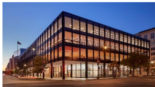
The Martin Luther King, Jr. Public Library

Up to the last minute information on the conference schedule can be found on the PCIA website: https://peacecorpsiran.org/CONFERENCE-SCHEDULE/