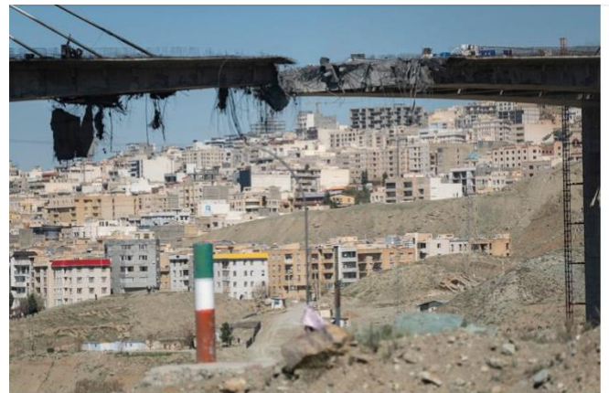
The Karaj bridge, several kilometers west of Tehran, which was destroyed during U.S.-Israeli military operations in Iran, on April 3, 2026.

Had the heavy bombing of the symbols and pillars of the Islamic Revolutionary Government of Iran been the sole targets of the war, the US/Israeli campaign might have been able to garner support among constituencies in Iran, the US and other countries. Alas the tens of thousands of bombs and missiles dropped and launched at Iran hit an ever expanding spectrum of targets, including 115,000 civilian structures, over 700 schools, 21 universities, a stadium, gymnasiums, 300 health care centers, pharmaceutical infrastructure, bridges and oil and gas infrastructure and storage facilities.